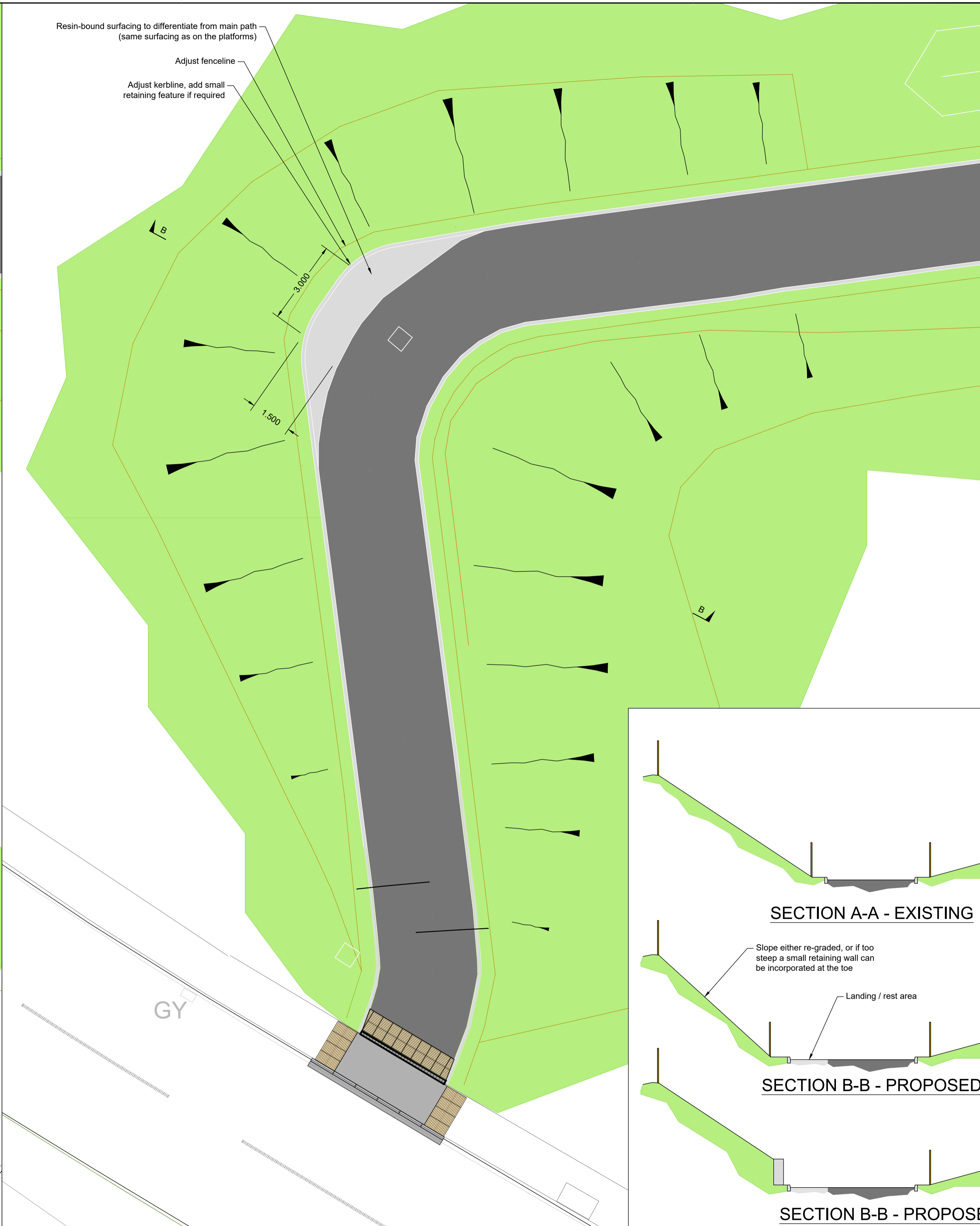
PLAN VIEW - PROPOSED